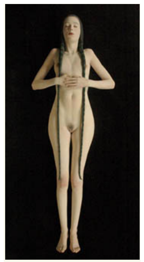
Judy Fox Snow White 2007 P.P.O.W